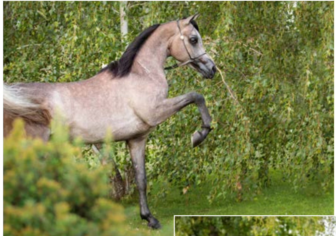
ARSHAN H VESUVIUS DPA | MAGIC SORAYA BY ANSATA SHAAMIS